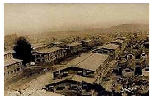
Fort Lewis in 1917