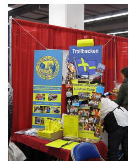
Swedish School and Trollbacken