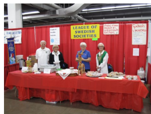
League of Swedish Societies