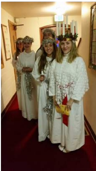
Oregon Lucia and court