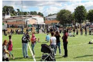
Annual soccer tournament