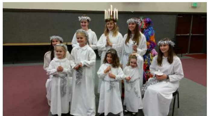
Swedish School Lucia with court