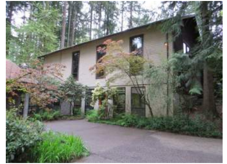
West Hills Unitarian Fellowship Church, 8470 S.W Oleson Rd, Portland