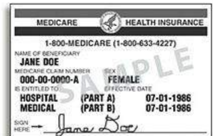
Sample Medicare Card

Enjoy a cup of coffee, have a refreshment and learn how to best utilize Medicare. No charge.