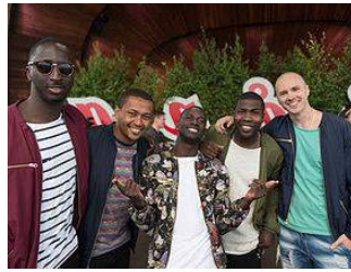
The band Panetoz