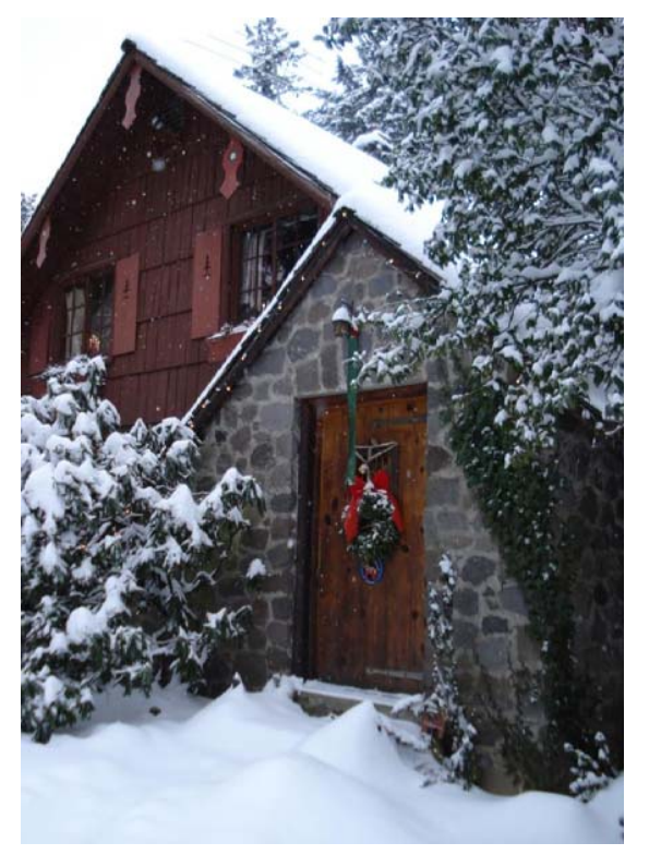
8740 SW Oleson Road in Portland