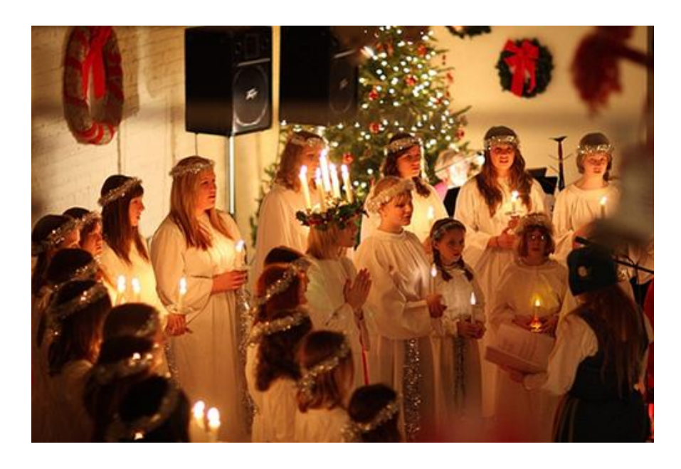
Saturday, December 8, 2012 - 3 PM,