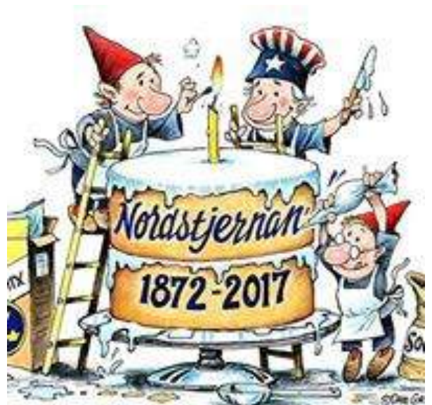
Nordstjernan 145 Years Celebration!

For more information go to: www.nordstjernan.com