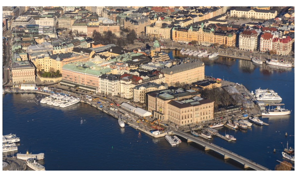
Area around Blasieholmen and Nybroviken

I'm arriving at Kungsträdgården Metro Station (1), located in the district of Norrmalm. The platform is located approximately 115ft (34m) under ground. During the exit from the metro station I see several relics rescued from the many buildings demolished, during the sometimes tragic redevelopment period of central Stockholm during the period of the 1950s and 1960s. I continue walking along the Birgit Nilsson Allè towards the Stockholm Ström waterfront area. Birgit Nilsson was the Swedish world known dramatic opera soprano excelling