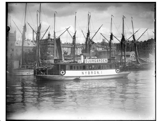
Ferry Nybroviken 1896

1966 at Nybroviken Bay in upright standing position with a cement overcoat... In the comic strips this was called Ståplats i Nybroviken. Here I see the local ferry ships that have been transporting people to and from this area to places around Stockholm for more than 100 years. I'm entering the Berzelii Park and sit down on a park bench to collect all the impressions from my walk. Berzelii Park (7) is a small park in central Stockholm. The park is the location of the China Theater, the Berns Salonger Restaurant and Theater (8). When I was a young man, many years ago, I went dancing at Berzelii Terassen on top of the theater building which was one of the "in-places", if you were interested in modern jazz and dance music in Stockholm. In "Orkesterjournalen", which was a publication addressing the jazz scene in Stockholm, they wrote "Den som älskar jazz har mycket att hämta på Berzelii Terassen" translated to "Anyone who loves jazz has a lot to learn from the Berzelii Terassen". This was a wonderful time