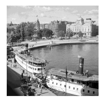
Waxholms Ships, 1940

I continue my walk towards Berzelii Park when I pass a well known fish restaurant Wedholms Fisk (5), one of the best in Stockholm, and I stop in for lunch. I see Ny-broviken to my right. It is so beautiful in the mid day sun light. For some reason this reminds me of an old disturbing story about the place. There is a Swedish term; Ståplats i Nybroviken (Standing Room Only at Nybroviken Bay); A murdered man was found in