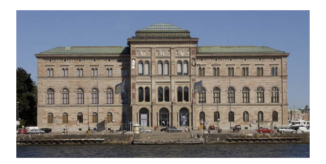
Nationalmuseum (2) is the national gallery of Sweden, located on the peninsula Blasieholmen in central Stockholm.