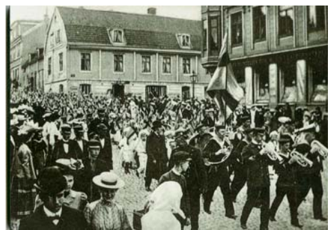
Kungliga Flottans Musikkår Barnes Dag Landskrona