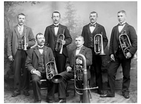
1909 Åtvid. Sextet