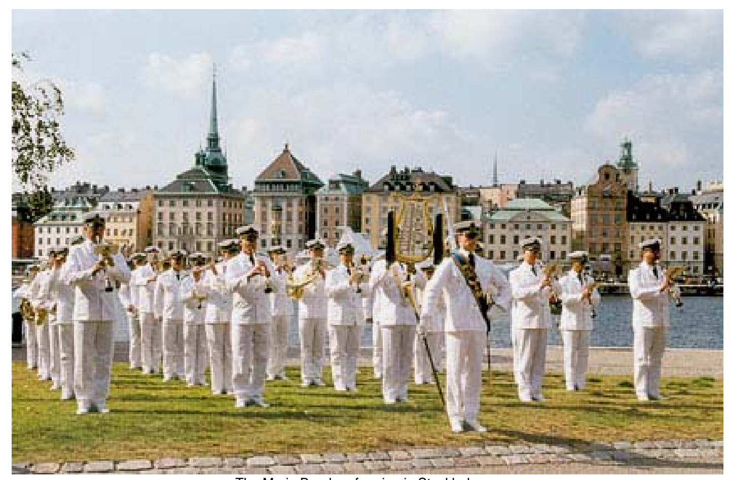
The Marin Band performing in Stockholm Picture: Marinens Musikkår (Royal Marine Band)