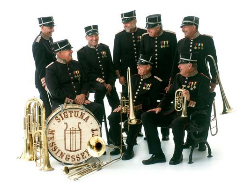
Sigtuna Brass Sextet

Along with the military brass band several private bands have es tablished themselves as strong representatives of the rich traditions established since the early