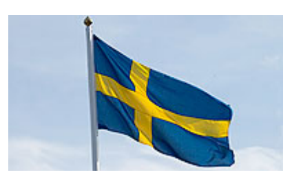
Blue and Yellow Flag

The best known composer is Viktor Widqvist (1898-1952) mainly due to his composition "Under Blågul Fana" (Under the Blue and Yellow Flag), and it has been recorded by brass bands all over the world. Widkvist was the 1898-1918 tuba player at Svea Ingenjörkårs musikkår in Stockholm, and also played violin in a theater orchestra. He