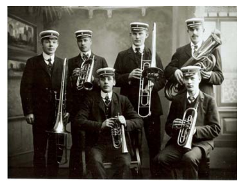
Liljan Sextet from Landskrona