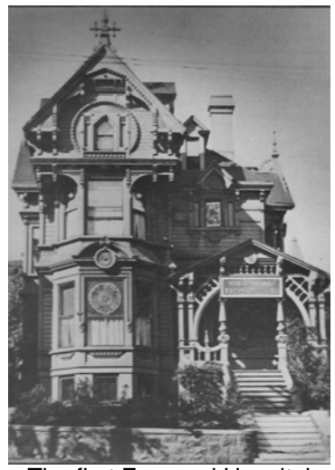
The first Emanuel Hospital building