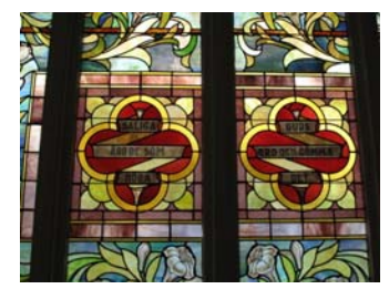
Stained glass windows With Swedish text