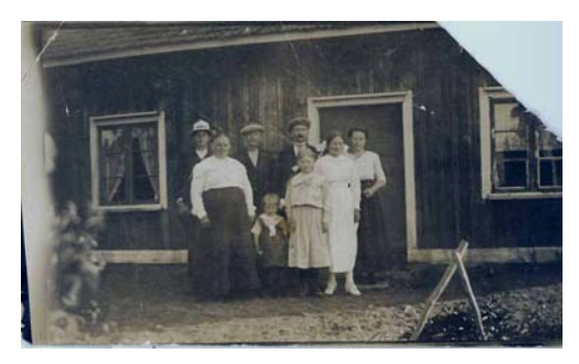
The family at Vedbladstorp