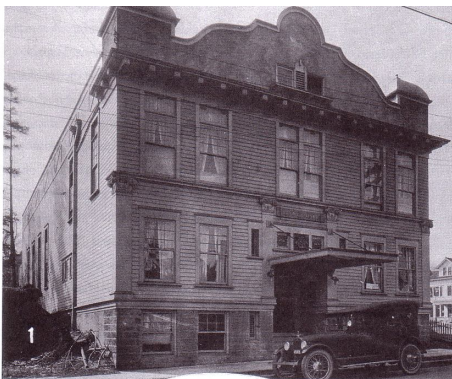
Linnea Hall then in 1910