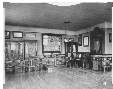
Ballroom Dancing Hall

The cornerstone to the building, Linnea Hall, was placed in the foundation on September 5, 1910. Though the membership reached an estimated 500 in the early 1920, it declined in the 1930s.