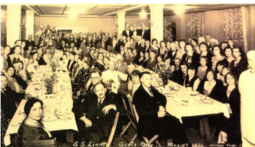
Gents night 1931 at Linnea Hall. The men cooked the dinner for the night.

The Society played a very important role in the cultural and historical development of Swedish heritage in Portland as documented by SRIO and others. The Society sponsored a variety of programs to make it easy for new immigrants to fit in the new foreign environment and to develop contacts for employment and relationships. This was done through activities such as picnics and parties, very much as we do today, and at all occasions Swedish was spoken, Swedish food was prepared and music played, and the Swedish folk tradition was observed.