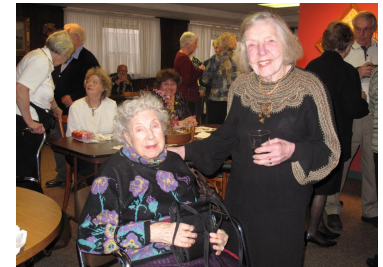
Long time members enjoying themselves