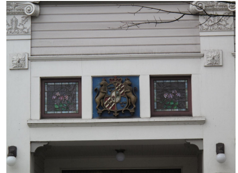
Cote of Arms over the doorway at Linnea Hall

This is well in line with the old Swedish saying; “för mannen är det ej godt att vara allena” (“it is not good for the man to be alone”).