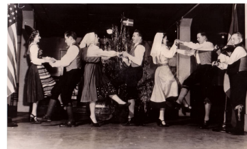
Portland Swedish Folkdance group 1930-1940.