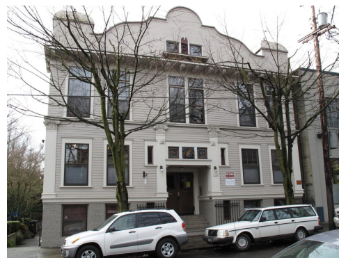
Linnea Hall today in 2009