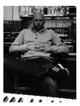
Black Panther composer Ludwig Göransson