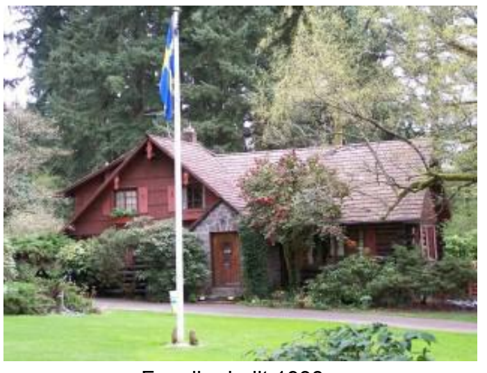
Fogelbo built 1938 -