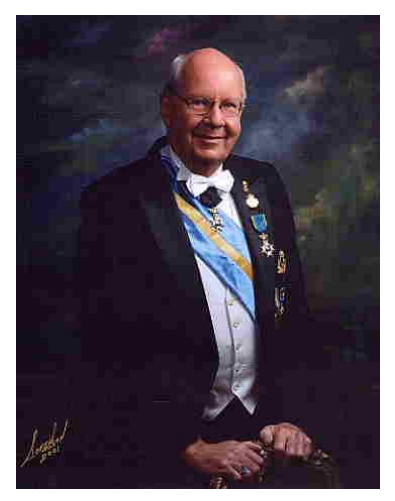
The original Knight of the Royal Order of the Polar Star painting is on display at the Christinaberg estate in Mora Sweden.

New Sweden Newsletter volume 94, 2009: A Fogelbo 60 years Anniversary - A truly Unique Swedish Treasure!