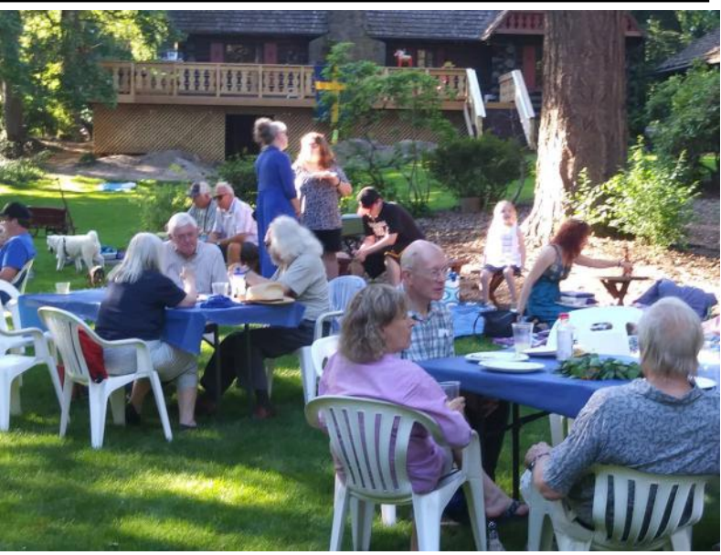
Please join us in celebrating Midsummer at Fogelbo on June 22. More information forthcoming in emails closer to the date.