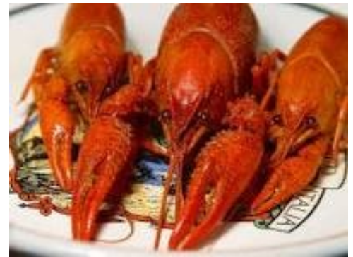
The Pacific NW Astacoidea Crayfish

Crayfish, also known as crawfish , crawdads , fresh-water lobsters , or mudbugs , are freshwater crustaceans resembling small lobsters, to which they are related; taxonomically, they are members of the superfamilies Astacoidea and Parastacoidea. They breathe through feather-like gills and are found in bodies of water that do not freeze to the bottom. They are mostly found in brooks and streams where there is fresh water running, and which have shelter against predators.