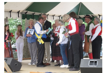
Midsummer Event pictures