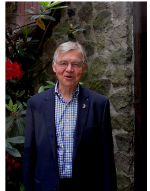
Consul Lars Jonsson

Portland, Oregon was recently visited by Lars Jonsson, Swedish Consul of Washington and Oregon States, based in the Seattle office of the Consulate of Sweden. More than 30 Swedes from the Portland/Vancouver area went to Seattle to renew their passports in May 2015 when the new passport application machine was on location. When it was time to pick up the passports the consul wanted to deliver them himself in Portland to save the applicants another trip to Seattle. However, the deeper objective with the visit to Portland was to meet and learn about as many Swedes as possible for the benefit of his role as consul for the Northwest region.