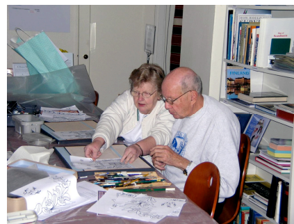
Picture Gallery from Dalmålning class