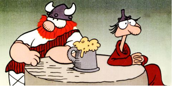
Don't think you're anyone special or that you're better than us.

http://www.alecta.se/Privat/Pensionens-delar/ (Tjänste pension). Most people tend to forget this piece even if it is small.