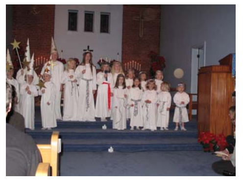
Swedish School Lucia