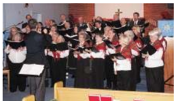
Scandinavian Men's Chorus and Ladies Chorus singing; Lyssna, Lyssna; Jul Strålande Jul, Gläns över sjö och strand.