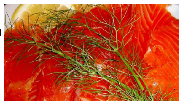
Gravlax with dill

Wipe the salmon clean. Remove all surface fat and bones. Pull bones out with a plier. Leave the skin on . Moisten the salmon with oil, mix the herbs with the dill and rub the mix onto the salmon.