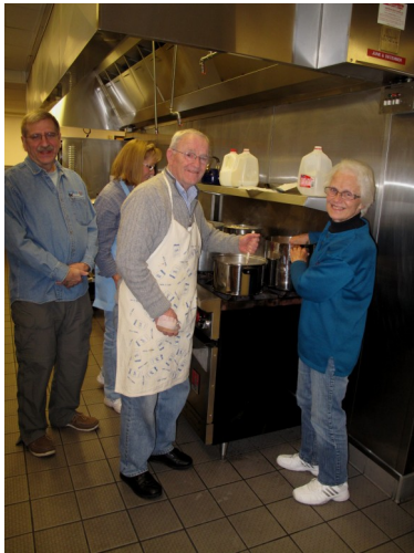
Stirring, stirring...more stirring Volunteer staff...

Ris à la Malta , is ricepudding (risgrynsgröt) mixed with whipped cream and served with fruit sauce.