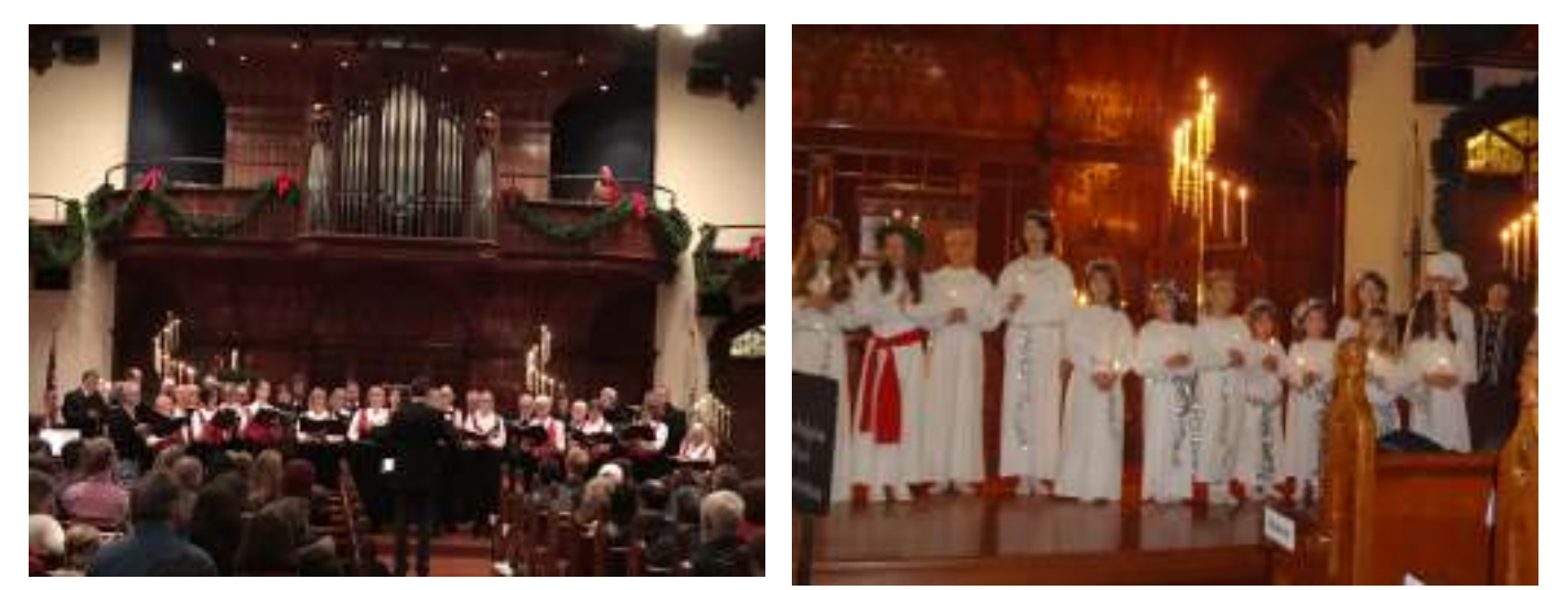
Portland Scandinavian Chorus