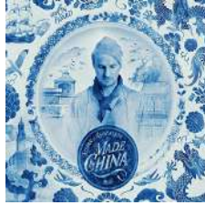
“Made In China”