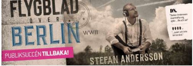
“Flygblad över Berlin (Flyers Over Berlin)”