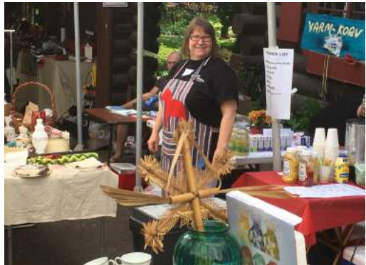
Fogelbo yard sale set-up crew