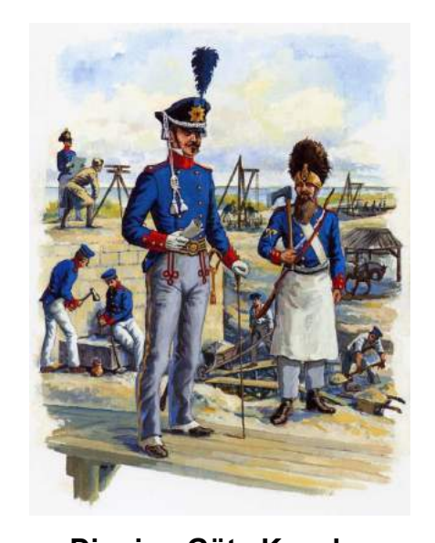
Digging Göta Kanal