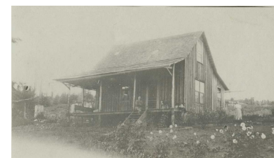
Cameron Creek Farm