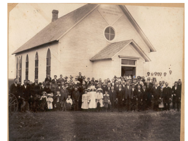
Church in Calhoun