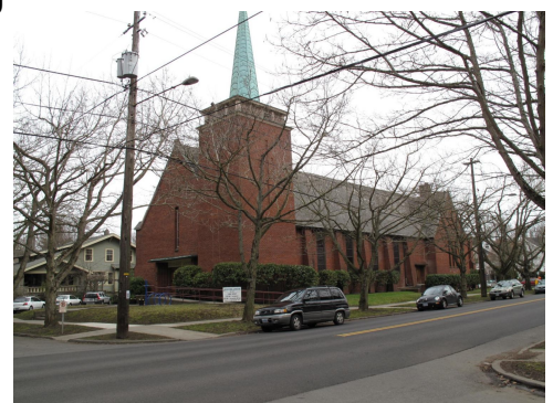
Augustana Lutheran Church