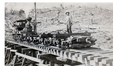
Ernest driving locomotive