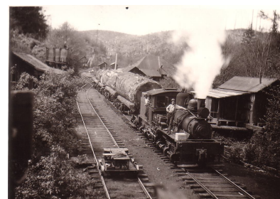
Logging train Leneve, OR