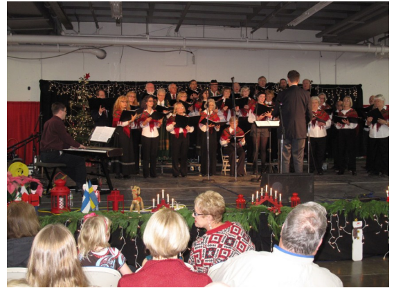
The Chorus at ScanFair

Since 1982, the chorus has been very active. The men's and women's choruses have hosted AUSS Western Division Conventions, and two AUSS National Conventions. The last one was in 2008. Three choruses from Sweden came to Portland and participated in the convention. There were about 350 singers on stage as 1,000 people filled the Portland Convention Center to hear the Grand Concert.