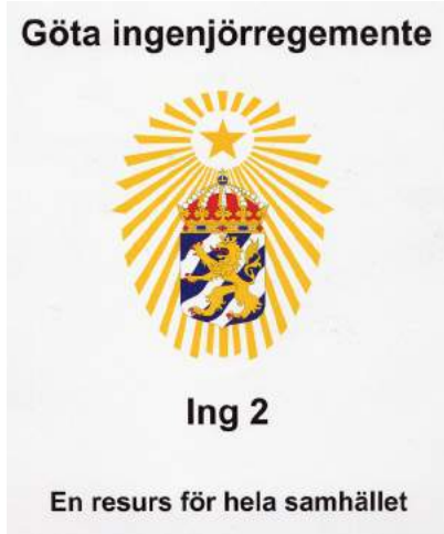
Göta Engineer Regiment Eng. 2 - "A unit prepared for the future"