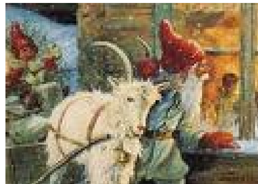
Tomten is arriving