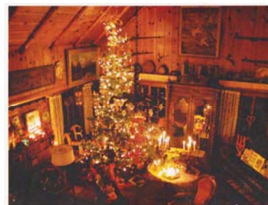
Traditional Christmas decoration at Fogelbo