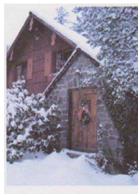
Fogelbo in winter garb