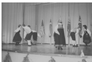
Leikaringen Dancers 1984