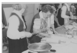
Grieg Lodge making lefse 1984