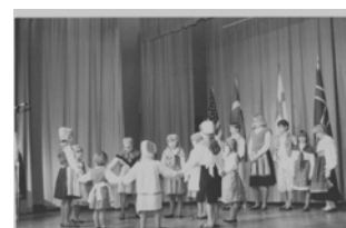
Vasa Youth Group Dancers 1984