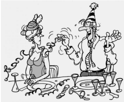
That funny paper hat will put you in the right mode my dear