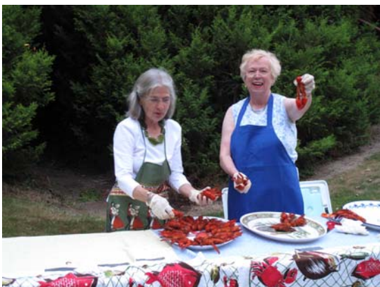
Thank You! Hard working ladies