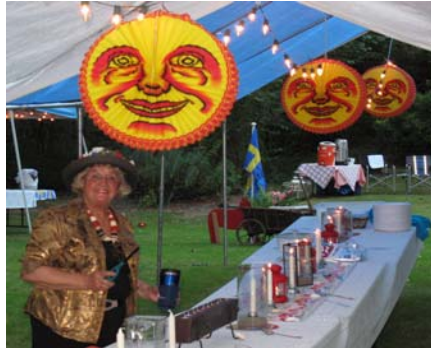
Preparation for the Big Party!