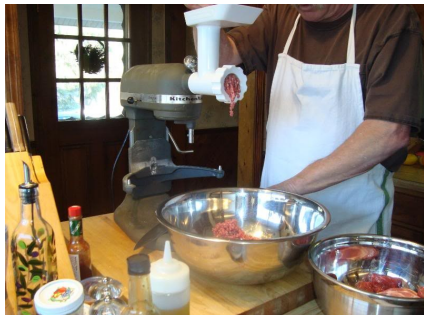
Ground, meet, onions and potatoes