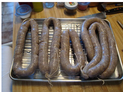
Fill the links with the meat mix

After working a long day making potato-sausages, followed by a very good dinner with potato-sausages and mashed potatoes I'll need a quiet time to regain my strength.