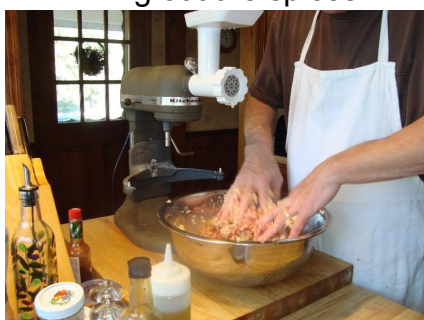
Mix spices and the meat mix

Potatiskorv (Värmlandskorv), and pork casings, are available in many European delicatessen stores in Oregon. Potatiskorv is served with mashed potatoes, a green salad and a Cold Beer and an Aquavit.