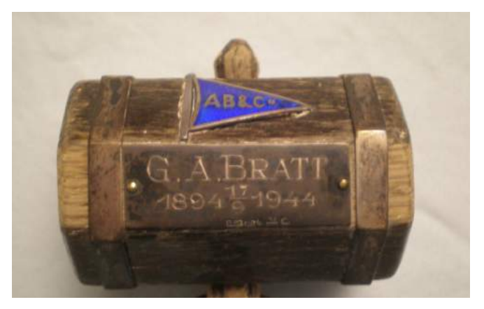
Gavel made of wood from the Admiral ship "Unity" (Enigheden in Danish) which was sunk by the Swedes in a battle in 1679.