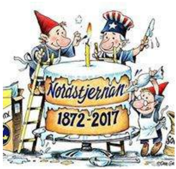
Nordstjernan 145 Years Celebration!

For more information go to: www.nordstjernan.com