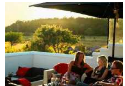
Öland restaurant Lammet och grisen

Öland is largely dominated by alvar, which is a biological environment based on limestone plain with thin or no soil and, as a result, sparse grassland vegetation supporting a distinctive group of prairie-like plants. It is very different from the rest of Sweden, and bears some resemblance to Iceland, although the latter has no significant amounts of limestone. In fact, an acoustic version of Molly Sanden's "Husavik" - featured in the Will Ferrell Netflix movie "Eurovision Song Contest - The Story Of Fire Saga" about an Icelandic musical duo with part of the story taking place in Iceland - was recently filmed on Öland. Both Öland and Iceland carry folklore about elves hiding in the cracks of its barren rocks. The restaurant "Lammet & Grisen (The Lamb and the Pig)" in northern Öland offers delicious food in a cosy environment, and from its rooftop terrace you've got an excellent view of the great expanse that is Öland's beckoning landscape.