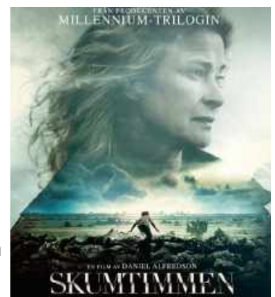
Movie adaptation of Johan Theorin's book "Skumtimmen (Echoes Of The Dead)".

One of my favorite Swedish authors, Johan Theorin, has captured the mysticism, lure and eeriness of Öland beautifully in many of his crime fiction novels that take place on the island. The 2013 movie adaptation of his debut "Skumtimmen (Echoes of the Dead)" was directed by Daniel Alfredson - who also directed two of the Millennium trilogy movies - and featured Lena Andre (Millenium, Wallander etc.) in the lead role. Öland's rugged beauty is a source of inspiration for Royalty, residents, visitors, authors, artists and everyone in between, and will likely remain a backdrop for stories yet untold in the future as well!