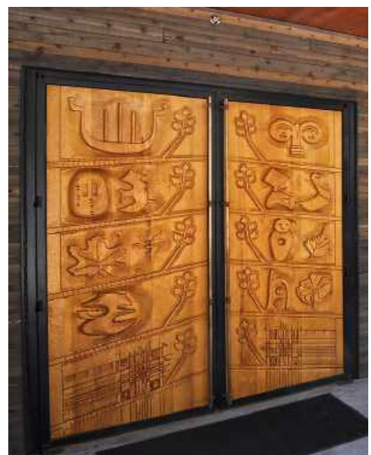
The doors to Nordia House