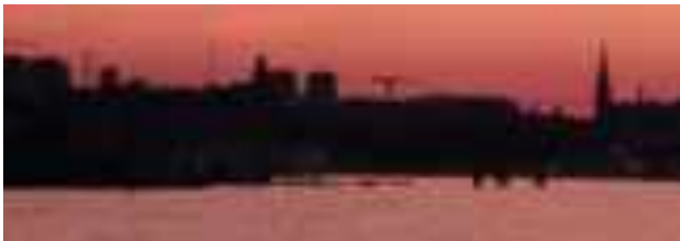
Stockholm in July 2019 - A Year Ago In A Different World (by Jimmy Granstrom)

New Sweden Cultural Heritage Society PO Box 80141 Portland, OR 97280