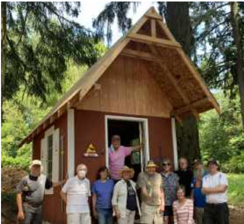
Stuga thanks lunch.