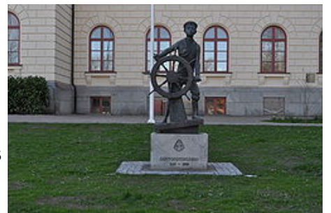
Skeppsgosse (naval cadet)