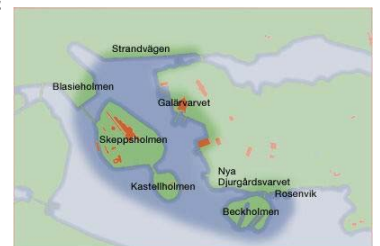
Stockholm Sjögård

The shipyard area is called “Stockholms Sjögård” covering the islands of Blasieholmen, Skeppsholmen, Kastellholmen, Beckholmen, Nya Djurgårdsvarvet, Galärvarvet and Strandvägen. Standing at the landing looking west I see Blasieholmen and Skeppsholmen.