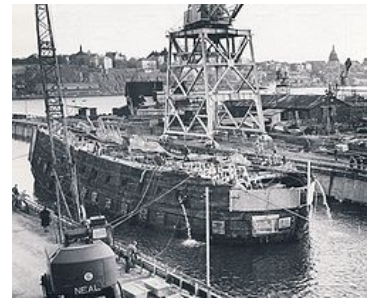
Vasavarvet receiving the salvaged ship

Blasieholmen is today dominated by Banks, the National Art Museum, the Grand Hotel, and traditional charters such as Sällskapet, Frimurarorden among others. Only a couple of hundred people live there permanently.