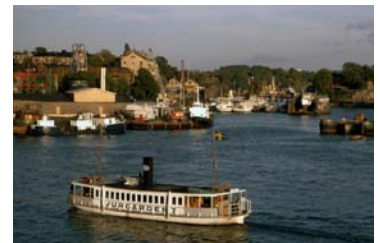
Ferry 7 to Djurgården

Again a dawning day and a soft perfume of newly mowed grass, from some island in Stockholm archipelago, touches my face as I slowly walk towards the ferry station. Perhaps it could be a piece of our powerful Swedish naval history softly speaking to me about long gone glory times. We take ferry number 7 to the island Djurgården from Slussen, which is arriving to the west of the shipyard area at the amusement park Gröna Lund and east of the Vasa Ship Museum at Galärvarvet.