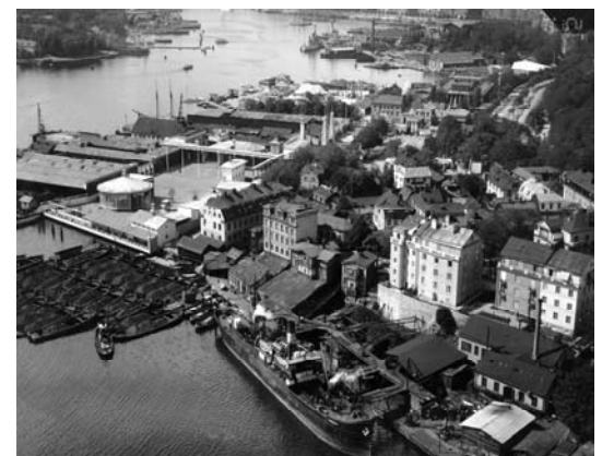
Djurgårdsvarvet, 1928