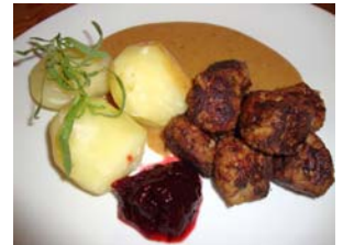
Köttbullar, potatoes, brown sauce and lingonberry jam