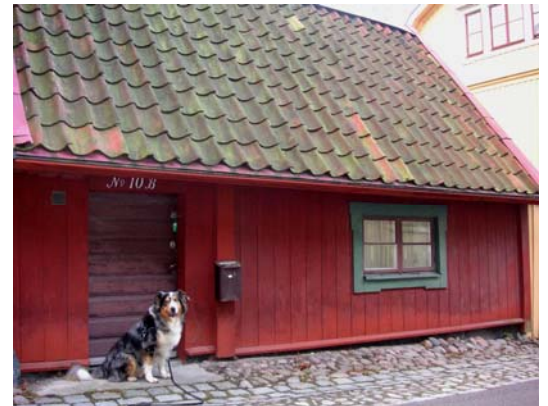
The Gravedigger's house