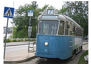
A25 "Mustang" tram