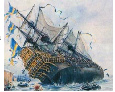
Vasa is going down under, 1628

This great naval history was pitifully short. On August 10, 1628, the 165 ft. three master, with a stern 50 ft. high, a sail area of 12,375 ft. and a displacement of 1,400 tons, the top heavy ship keeled over after sailing a few hundred yards on her maiden voyage from Skeppsgården shipyard. From there, Vasa went down with sails up and flags flying.