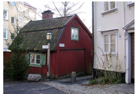
Skampådens torg (The pillory square)