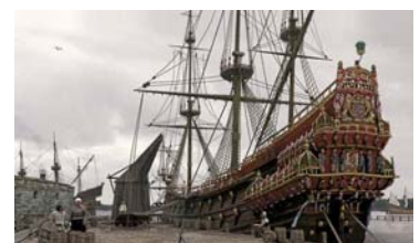
Regalskeppet Vasa, 1628

Blasieholmen is today a peninsula, but in the past it was an island parted from Norrmalm via a small area of water called Nöckström . Later it was filled in. The old navy shipyard, then located at the castle “Tre Kronor” across the bay to the south, was moved by king Gustav Vasa the 1550's, to this small island, that then got the name “Skeppsholmen” in 1565. In the early 1600, the naval shipyard at Blasieholmen/Skeppsholmen was Sweden's largest workplace. On this island, during the period 1626-1628, the navy built the Swedish Warship Vasa, with the help of Swedish and Dutch carpenters, with the intent to build the Great Swedish Naval Power on the European scene.