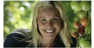
TV Chef Tina Nordström