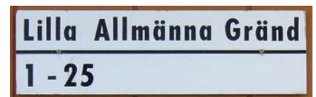
Small Common Alley

After digesting these breathtaking views, we continue our walk north along Almänna Gränd (Common Alley) adjacent to the Gröna Lund amusement park, and I see a very impressive building in front of us, the famous restaurant Hasselbacken , the center of Swedish culinary traditions, where you are able to eat the best " Biff Special " ( kock recept.nu ) in Stockholm, but we are not going that far. We are turning onto Lilla Allmänna Gänd toward Djurgårds varvet.