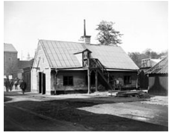
Järnvägs Huset (Railroad House), 1909

Over the years when larger and larger ships were requested the Navy to build more repair and maintenance shops for the navy the Örlogsvarvet was established. Stockholms Örlogsvarv was the navy's shipyard. The shipyard had activities on Galärvarvet on Djurgården, and Skeppsholmen's east side on Beckholmen. The shipyard was a very large workplace with with over 1200 workers employed. The navy shipyard was closed 1969.