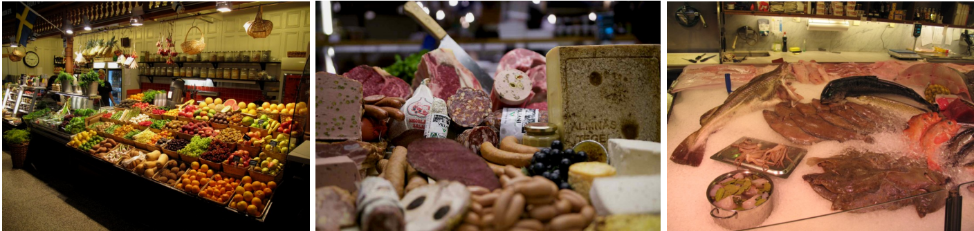
Various produce at the market hall

Here I find the most exquisit offering of vegetables, charcuteries, and seafood. The ambience, colors and scents are fantastic and are setting the tone for the entire market hall.