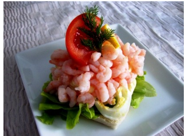
Shrimp sandwich (räkmacka in Swedish)