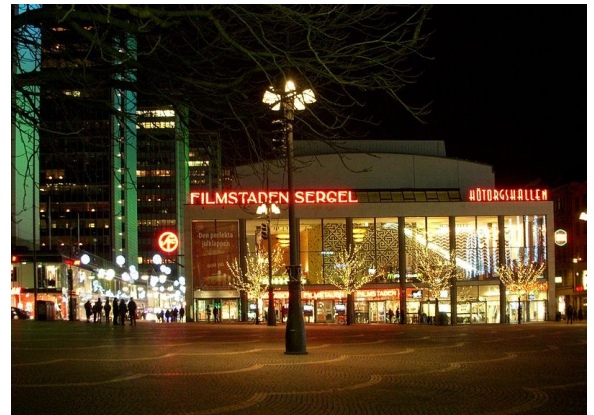
Hötorgshallen 2008