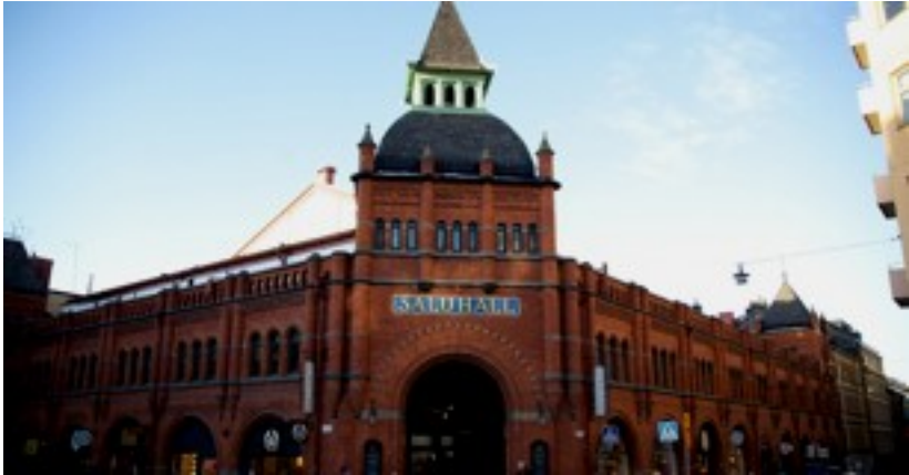
Östermalms Saluhall, front view 2013

Leaving the subway station and walking accross Östermalms torg, I see the Östermalms Saluhall, a very large building with a facad of red clinker bricks, cement and ironwork. With it's very impressive brickbuilding front, the building project an impression of a real old fashion market hall. The internationally renowned magazine Bon Appetit ranked the Östermalm Saluhall the seventh best market hall in the world.