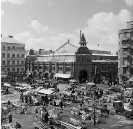
Östermalms Saluhall, early 1900

When I enter into the market hall itself I'm met by an overwhelming view of all the vendors and their range of food offerings. I will never find something similar in any supermarket in the USA. This is a different world to immerse myself in, and just enjoy the market hall ambience of color, aroma and people.