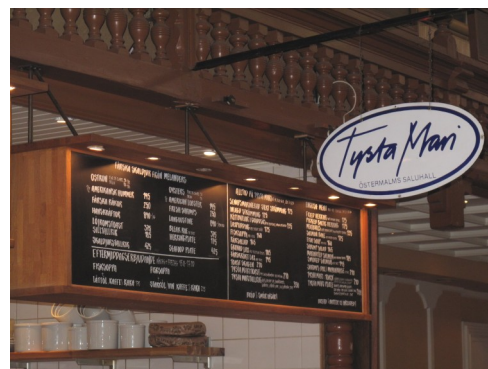
Tysta Mari restaurant

My walking trip to some of the market halls in Stockholm is over, but I would like to end with a recommendation to the reader to visit, taste and experience the ambience these market places provide to the visitor, as this is an integral part of the life in Stockholm.