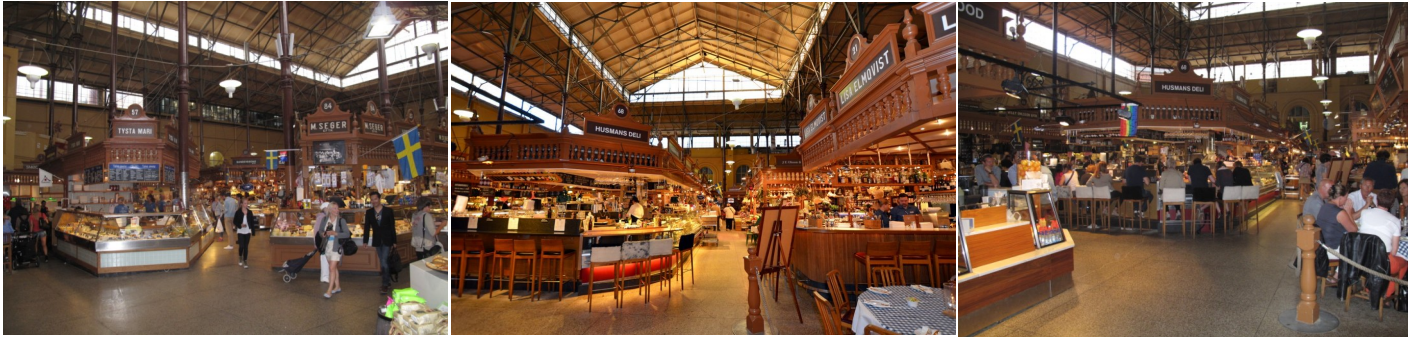
Views from the Östermalms Saluhall entrance

When I enter into the market hall itself I'm met by an overwhelming view of all the vendors and their range of food offerings. I will never find something similar in any supermarket in the USA. This is a different world to immerse myself in, and just enjoy the market hall ambience of color, aroma and people.