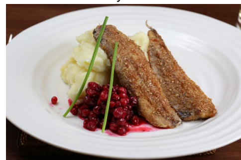
Fried herring dinner