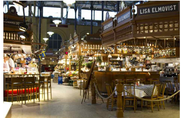
A view at Östermalms Market Hall