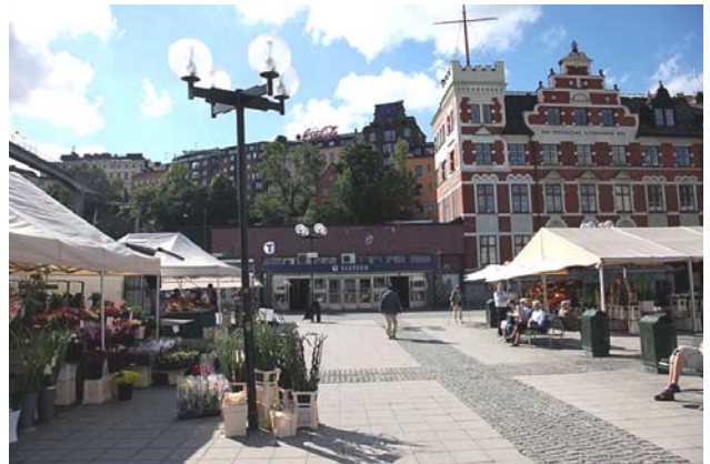
Ryssgården square in front of the Slussen metro station.

The focus for this walkabout is in the area of Götgatan, Åsögatan, Åsöberget and Stigbergsgatan at Södermalm in Stockholm. To get there we start at Slussen ( the Locks ), an area in central Stockholm, connecting Södermalm and Gamla stan (Old Town). The area is named after the locks between Lake Mälaren and the Baltic Sea. The locks themselves allow passage between these two bodies of water of different levels (~2 meter).