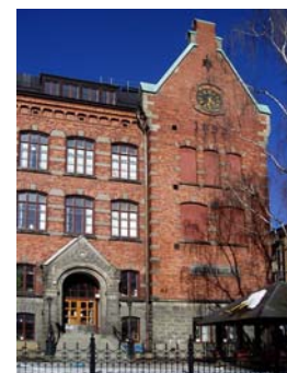
Katarina Norra Skola