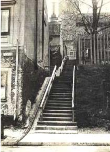
Sista Styverns stairs 1923

On my way back to Slussen I take the way of Sista Styverns trappor which are long wooden stairs from Stigbergsgatan to Fjällgatan, from which I have an overwhelming panoramic view over Stockholm's Old Town and the island of Djurgården.