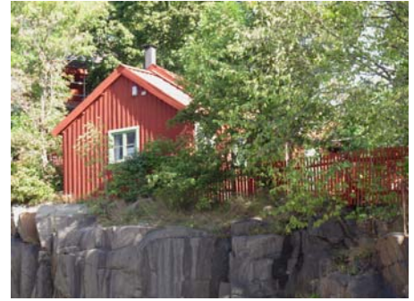
AB Svenska Ord writing quarter

Upon a small hill in front of us I see a small red cottage which was “Hasse & Tage’s writers’ quarter”. The cottage belonged to the comedians Hasse Alfredsson and Tage Danielsson, or AB Svenska Ord (Swedish Word Inc.), one of the most productive and funny set of characters for the cabaret and radio entertainment in Sweden. More information available at Hasse och Tage - Wikipedia.