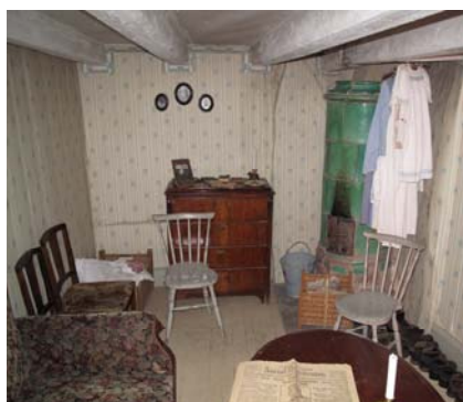
Pulley-Block maker living room