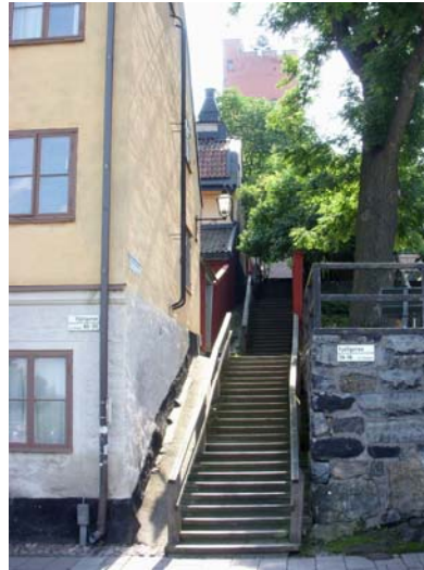
Sista Styverns stairs 2010