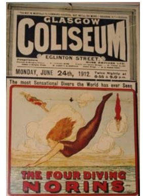
Four diving Norins