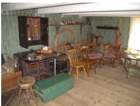
Pulley-Block maker workshop

The house is fully restored as it looked in early 1900s, allowing guests to view how the life could be for families at this time. This place is a must for a visitor to Stockholm to see.