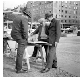
Chess players 1957