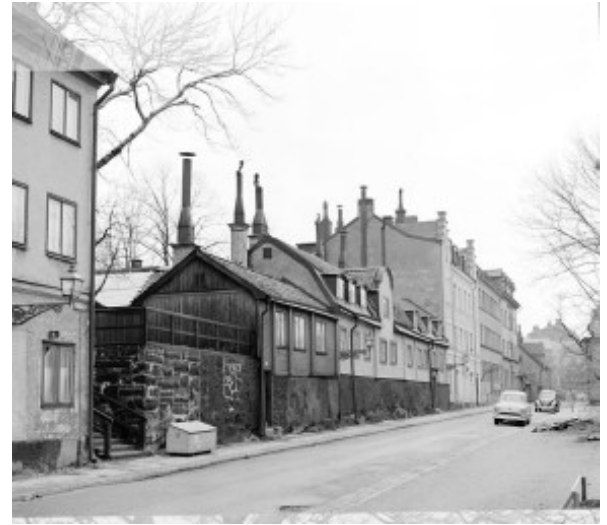
Fjällgatan westwards to Katarinavägen 1926

The name “Sista Styvern” was adopted from an Inn situated at Stadsgården. The name for the Inn belong to the same category such as Pungpinan in Skarpnäck and Fördärvet (the blight) at Långholmen, thus places where you could lose your money as well as your health. Sista Styverns stairs appears in the novel “Flickan i Stadsgården” by the author August Blanche.