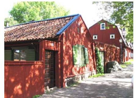
Pulley-Block makers house, #21

Stigbergsgatan (Stig Berg Street) red cottages are now modernized and carefully renovated homes. One of the houses, #No 21, has been preserved as a museum. It’s the Pulley Block Maker’s house that was decorated by the Stockholm Stads Museum to show an interior relating to the early 1900s.