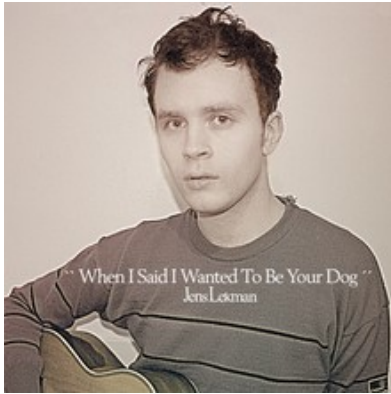
First full-length album