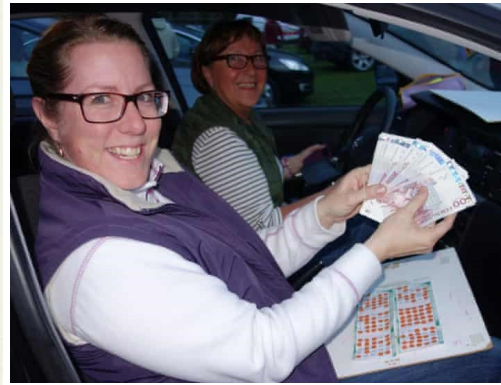
Swedes at a drive-in bingo