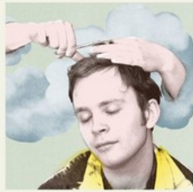
Night Falls Over Kortedala