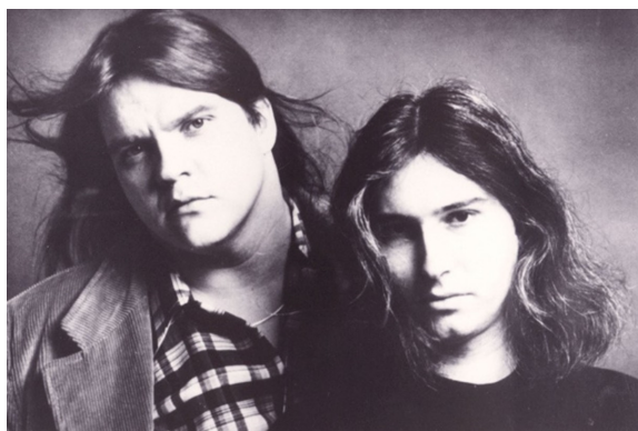
Meat Loaf & Jim Steinman