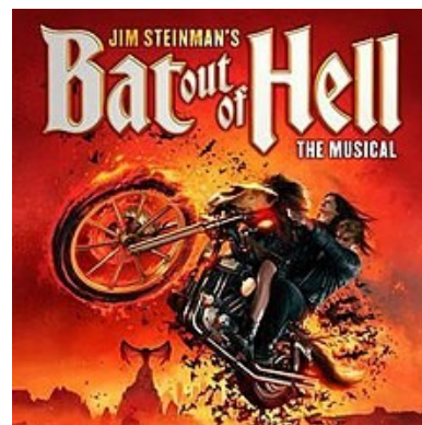
Bat Out Of Hell album (1977) and musical (2017)

On January 20, legendary rock singer Meat Loaf passed away. A week after his death, Meat Loaf's 1977 debut album "Bat Out Of Hell" - one of the five best-selling albums of all time - topped the album charts in Ireland and Australia, and reached its highest ever chart positions in the U.K. at #3 and the U.S. at #13. All the songs on the album were written by Jim Steinman, who passed away on April 19 2021. Meat Loaf and Steinman both started their careers in theater, and met when Meat Loaf auditioned for Steinman's musical "More Than You Deserve" in New York in 1973. Spin Magazine called that meeting "One of the Top 10 most important moments in the history of rock n' roll". Nearly every record label rejected "Bat Out Of Hell" but it went on to sell an incredible 43 million copies, staying in the Top 100 UK Album chart for an astonishing 522 weeks and continued to sell 200.000+ copies yearly even before Meat Loaf's death. 40 years after "Bat Out Of Hell" was released, a musical version premiered in Manchester in 2017 and is currently touring different parts of the United Kingdom until November. After going separate ways in the early 1980's, Meat Loaf and Steinman re-united for the sequel "Bat Out Of Hell 2" released in 1993. The album became Meat Loaf's first (and only) #1 in the U.S., and spawned the monster hit "I'd Do Anything For Love (But I Won't Do That)" which reached #1 in 28 countries.