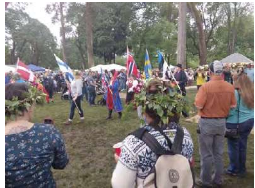
Procession of scandinavian flags. From left to right: Denmark, Finland, Norway, Iceland, Sweden, and Estonia