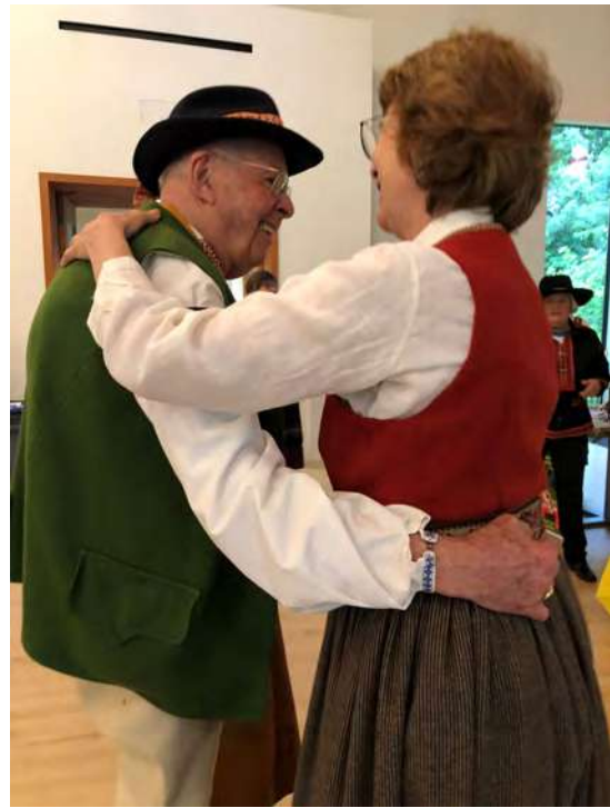
Dancing at Ross' 70 years at Fogelbo